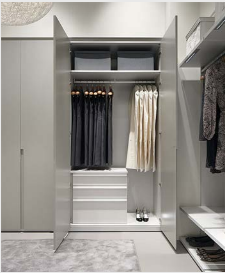
Laminated wardrobes of DICA