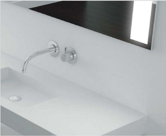
Bathroom sink SOHO of HIDROBOX