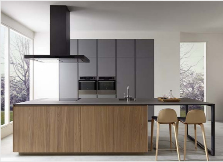
Laminated kitchen closets of DICA