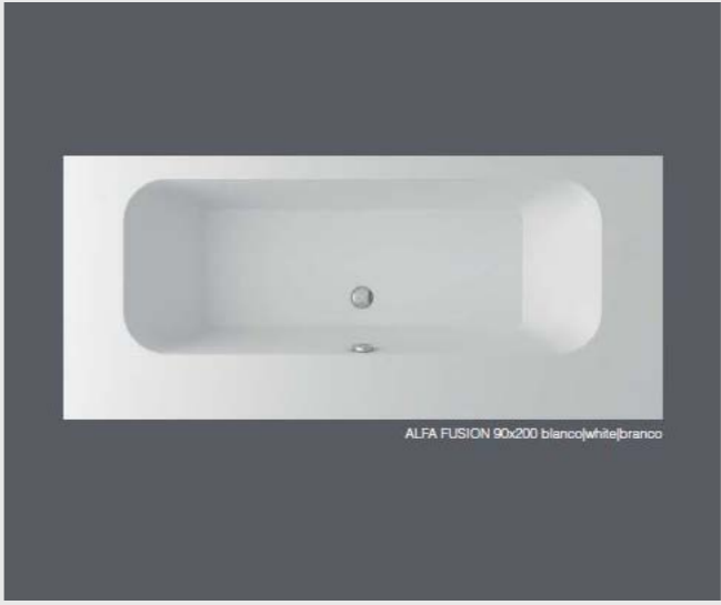
Bath ALFA FUSION of HIDROBOX