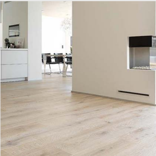
Parquet OAK BOSSANOVA of ADMONT