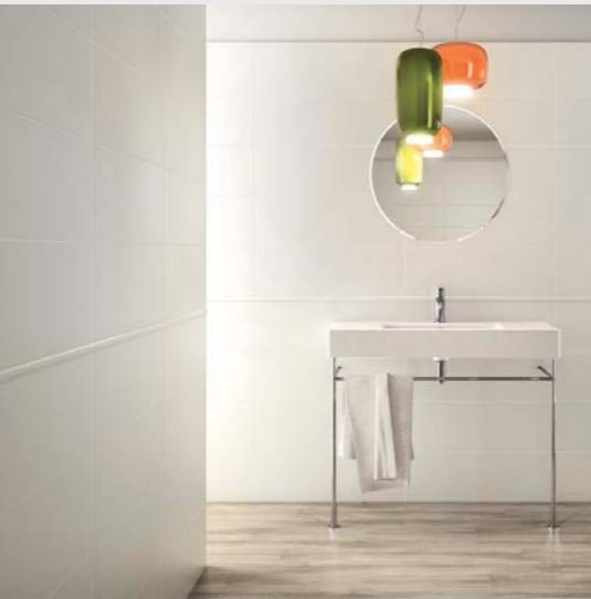
WHITE LUX wallcoverings of ASCO CERAMICHE