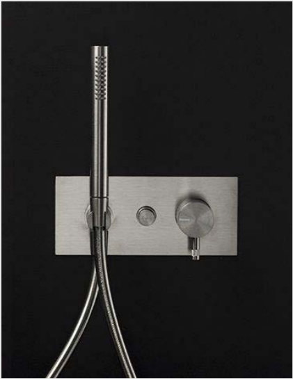
Taps DIAMETRO35 CHROME of RITMONIO