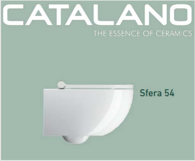
Toilets SFERA of CATALANO