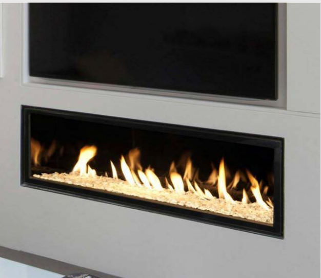
Fireplace COSMOS 145 panoramic BODART&GONAY